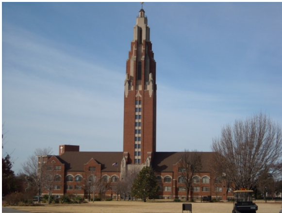
Oklahoma City University