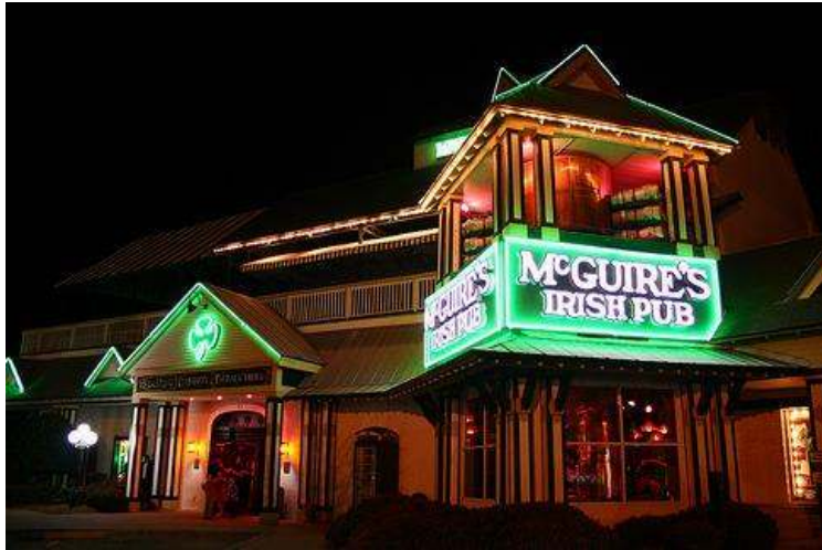
McGuire's Irish Pub

In the 1970's, the owner of the bar tacked her first tip, one dollar, to the bar. Later, guests started doing the same and with time, this became tradition. Today there are more than $550,000 one dollar bills hanging from the ceiling of McGuire's. Consequently, McGuire's is not only a good choice if you want to eat something, but it is also nice just to walk through the pub and take a look around.