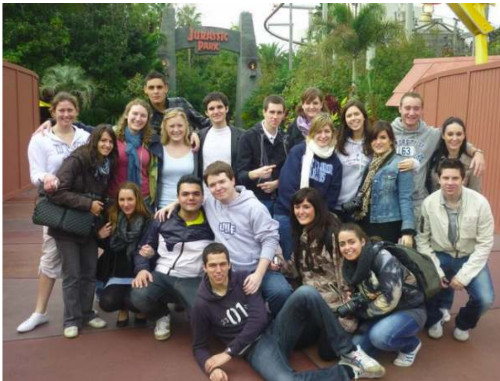
Our "crew" at Universal in Orlando

When spending a semester in America, travelling is a very good possibility to spend your leisure time. Domestic flights are most of the time very cheap and you can also go by car. When I spent my semester abroad in Florida, my friends and me rented cars all the time and went to many different places such as Orlando, New Orleans, Jacksonville, Tampa, St.Petersburg, Daytona Beach or St.Augustine. During Spring Break I took a flight to Miami and spent 10 days exploring Miami, the Everglades and the Miami Keys. It was an amazing experience and I can really recommend to save some money for travelling beforehand 😊