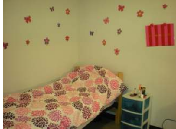
My room in Village East