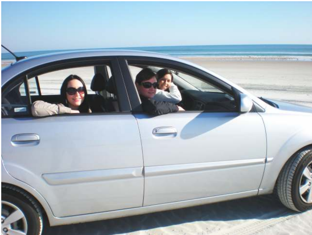
Driving our car on the beach in Daytona