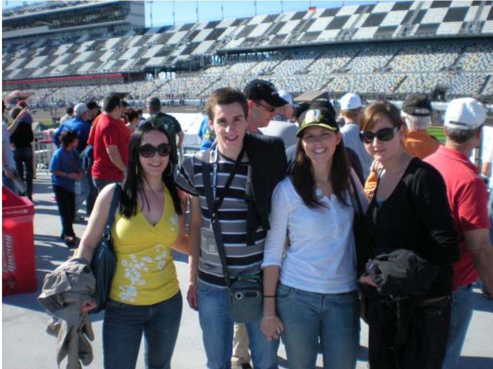
At a NASCAR Race in Daytona Beach