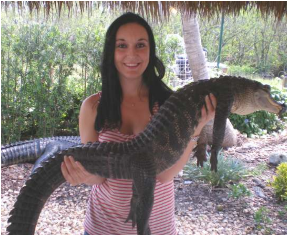
Holding an alligator in the Everglades