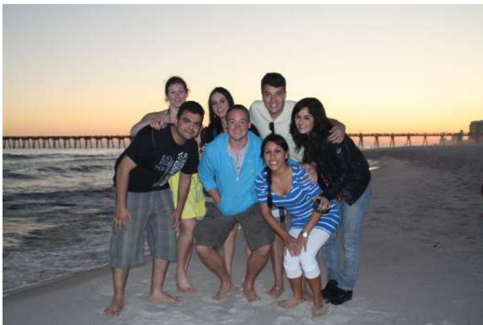
Beautiful Pensacola Beach

First of all- Pensacola is not New York City, it is not Miami and it is not Las Vegas ☺ So don't be surprised to find out that Pensacola, with its population of about 50,000 people, might not differ a lot from your hometown in Austria. Nevertheless it is a very nice city to live and, moreover, its beaches are amazing. Even though Pensacola is just small, there are still a lot of things you can do.