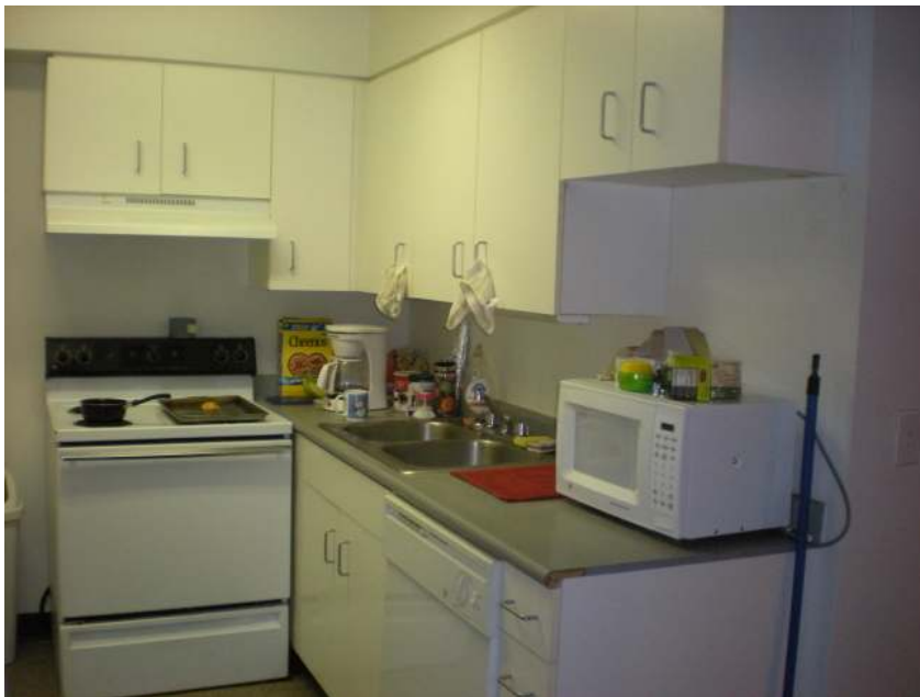
The kitchen area

Generally, the apartments in Village East are quite nice and if people work together with their roommates, the place will also be clean. However, one might experience some unforeseeable occurrences. Some people can be quite messy and of course it is not a good thing to live with people who never clean up and always leave behind a complete a mess. If that's the case, don't be afraid of asking for an apartment change. I have been in the same situation and at first I was a bit afraid of asking for another place.