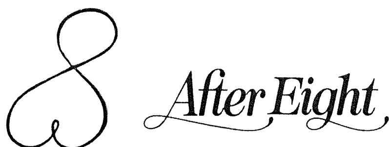
Fig. 2: A draft of a new logo for an old trademark

postal service. As an icon it represents a post horn. And it offers unlimited indexical properties: From the place of application we may infer that this car or building is used or was used by the postal service, or that the “Hotel Post” was in use a century ago, and that the colour of the logo must have been refreshed very recently, etc. Pictograms can be viewed as elements of written schemata (Fischer 1997) and are used and interpreted in similar ways as synecdochic or metonymic verbal expressions. Figural thinking is reflected in both the diagrams of the special type called “logical, non-representational, arbitrary pictures” and the corresponding figures of speech, i.e. spatial metaphors. These diagrams capture, as it were, different figures of speech that can be assigned to different metaphor families, such as the path, the inclusion, and the subsumption metaphors (Fenk 1994, 1999).